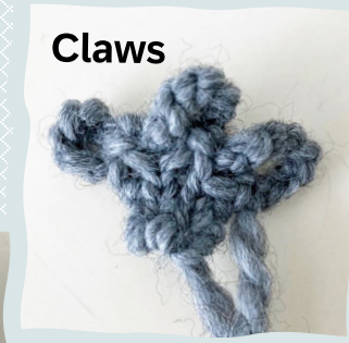
Claws knitted together and felted in shape