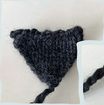
Tail knitted together